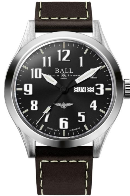
NM2180C-L2J-BK Naval Aviator Insignia