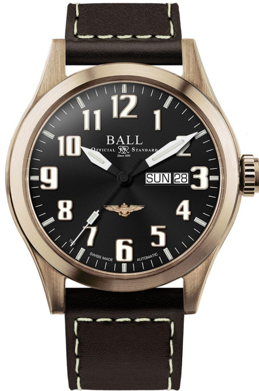
NM2186C-L1J-BK Naval Aviator Insignia