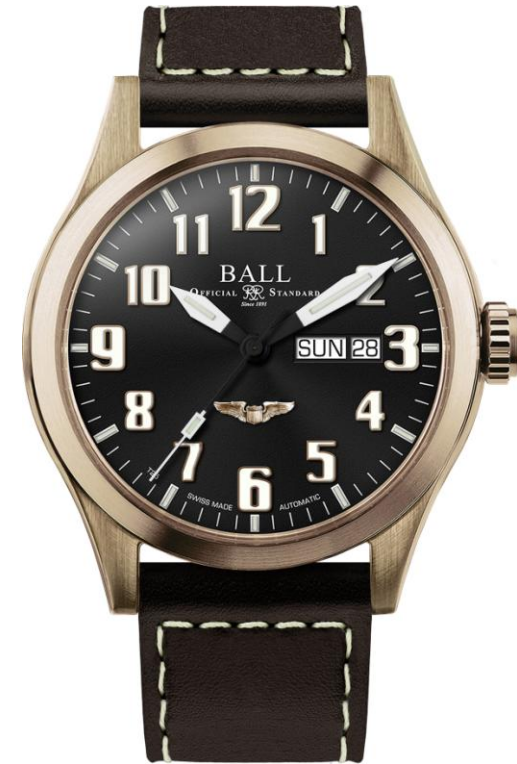
NM2186C-L2J-BK USAF Pilot Wings Insignia