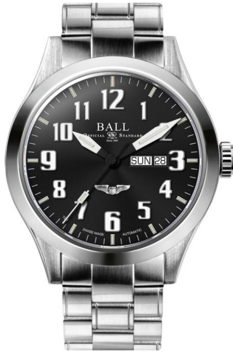
NM2180C-S3J-BK USAF Pilot Wings Insignia