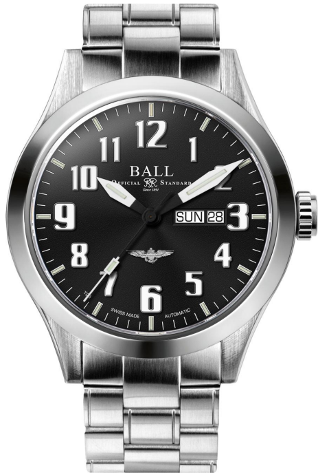
NM2180C-S2J-BK Naval Aviator Insignia