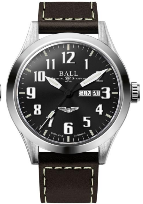
NM2180C-L3J-BK USAF Pilot Wings Insignia