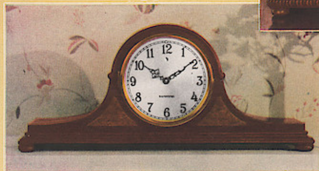
CONVERSE (No. 189) —A mantel clock of simple beauty. Case is of Honduras mahogany with Maidou Burl overlays. Height 9 \frac{1}{4} " width 22" depth 6 \frac{1}{2} ". Full Westminster Chimes. List..... $82.50