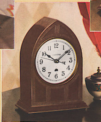
THE RAVENSWOOD MODEL is bakelite in walnut color 7" high. Has convex crystal and silver-finished dial 3 1/4". Like all other Hammond models tells time to the exact second. List..... $9.75

T HERE are no springs in this modern all-electric clock mechanism; therefore no winding. Regulating is done electrically. No bother, no attention whatever with the Hammond All-Electric Clock.