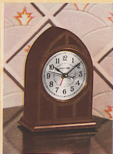
THE RAVENSWOOD ALARM has bakelite case, walnut color, 7" high, 4" wide, silver finished dial. Convex crystal, 3 1/4" dial. Buzzer alarm sounds until turned off. Ideal boudoir clock. List..... $12.50