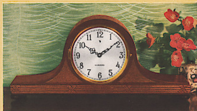
DIVERSEY (No. 153) —An elegant mantel clock with case of Honduras Mahogany and Maidou Burl overlays. Height 9 \frac{1}{4} " width 20 \frac{1}{2} " depth 6 \frac{1}{2} ". Full Westminster chimes. List..... $82.50