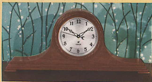
THE CAMBRIDGE—a deluxe tambour model. Note the hand carved bezel ring instead of metal bezel. This clock has walnut case 20" wide and 9" high, spun-silver dial 5 1/2" in diameter, separable cord and plug provided. An elegant mantel clock. List..... $32.50