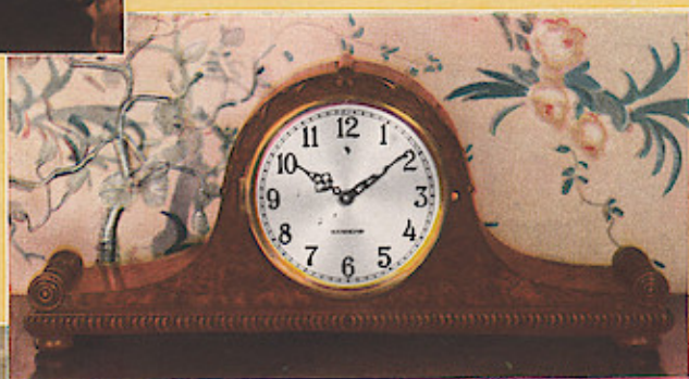
CLAIBORNE (No. 190) —An unusually beautiful labour of Honduras mahogany with mouldings and carvings-out from the solid wood. Height 9 \frac{1}{4} " width 22" depth 6 \frac{1}{2} ". Full Westminster Chimes. List..... $90.00