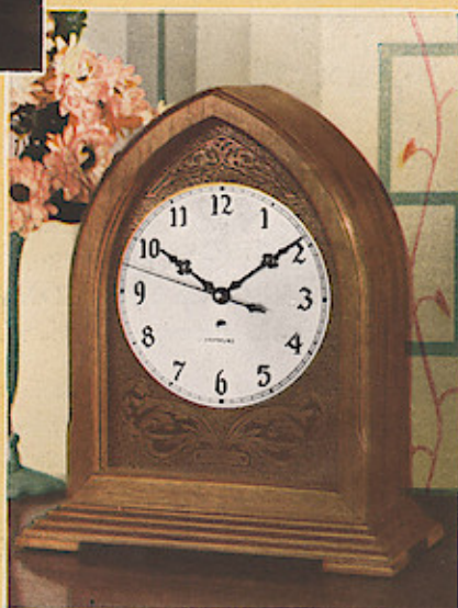
THE GOTHIC MODEL is a beautiful mantel clock. Has walnut case and spun-silver dial 5 1/2" in diameter. Height 12", base 4 3/4" x 9 1/4". Numerals are artistic and easily read from a distance. List..... $29.50

T HERE are no springs in this modern all-electric clock mechanism; therefore no winding. Regulating is done electrically. No bother, no attention whatever with the Hammond All-Electric Clock.