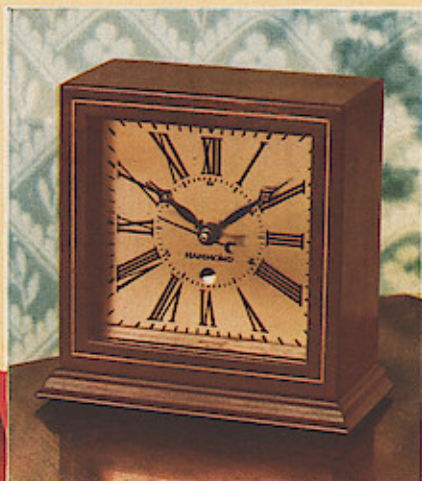
THE COLONIAL is an artistic model. Case is solid walnut 6" x 5" with light wood inlay. Dial is bronze with black Roman numerals. Base is 3" x 5 1/2". List..... $14.50