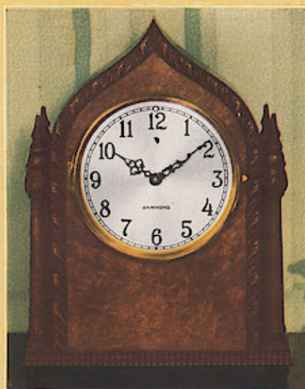
CHALMETTE (No. 138) —The mantel chime clock deluxe. Case is solid Honduras mahogany. Maple burl front with ornaments carved from the solid wood. Height 15" width 10 \frac{1}{2} " depth 6 \frac{1}{2} ". Full Westminster Chimes. List..... $110.00