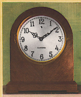
MERIDIAN (No. 188) —The Case is well constructed with Oriental Striped Veneer and solid mahogany mouldings. Full Westminster Chimes. Height 11 \frac{1}{2} " width 9 \frac{3}{4} " depth 6 \frac{1}{2} ". List..... $72.50