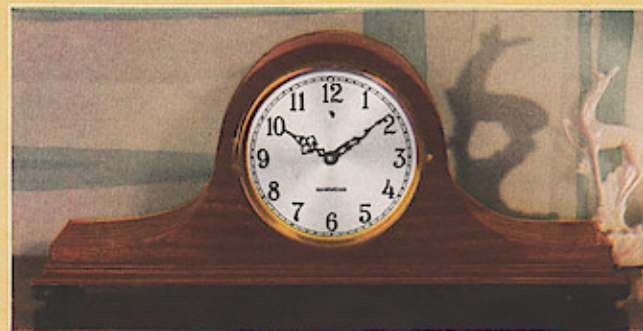
COLFAX (No. 124) —Plain lines for the modest and trim mantelpiece. Honduras mahogany case, 5-ply hood; 7-ply front and back veneer. Solid mahogany mouldings. Full Westminster Chimes. Height 9 \frac{1}{2} " width 22" depth 6 \frac{1}{2} ". List..... $77.50