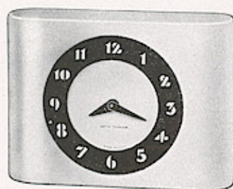
DU BARRY $6.95